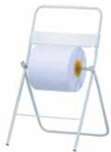
G521 White Dispenser for industrial towels