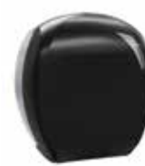
G907 Carbon Dispenser for Mini Jumbo toilet paper