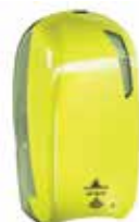
G924 Fluo Dispenser for liquid soap Sensor type