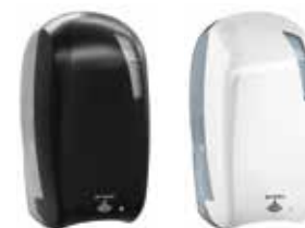
G924 Carbon G924 White Liquid Soap Dispenser - Sensor type

All our dispensers also include an assembly kit.