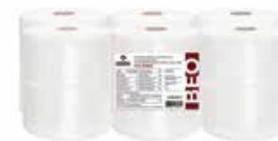
GCP 90M/12 Toilet paper Center Pull 90m

The practical 2-in-1 dispenser, with its innovative technology, allows you to distribute rolls of paper as well as non-woven masks. Perfect for hygienic and fast distribution, it is made of high-quality materials.