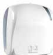
G885 White Dispenser for AutoCut towels Sensor type