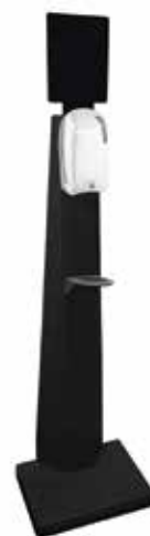
G939 Dispenser holder

Floor stand, dispenser column made of painted metal, with an advertising board