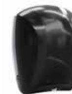
G932 Carbon Dispenser for Center Pull toilet paper