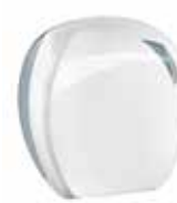
G907 White Dispenser for Mini Jumbo toilet paper