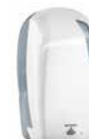
G928 White Dispenser for disinfection Sensor type