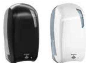
G926 Carbon G926 White Liquid Soap Dispenser - Sensor type

The liquid soap dispenser, equipped with photocell activation, guarantees maximum hygiene and prevents product wastage. Works with 4 'AA' batteries - not included.