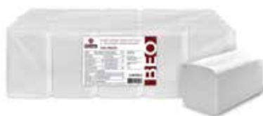
GSC 200/20 Napkins 200kom.

All napkin dispensers have space for inserting labels, which help you to personalize your dispensers.