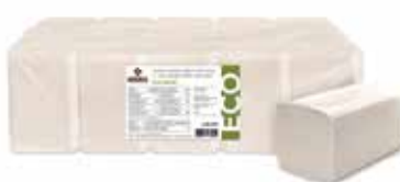
GSI 200/20 Napkins 200kom.