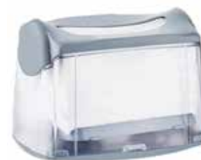
G898 Turquoise Napkin Dispenser