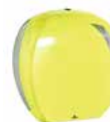
G907 Fluo Dispenser for Mini Jumbo toilet paper