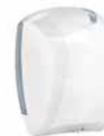
G932 White Dispenser for Center Pull toilet paper