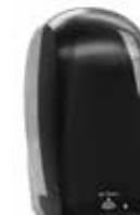
G928 Carbon Dispenser for disinfection Sensor type