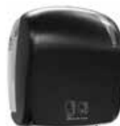
G885 Carbon Dispenser for AutoCut towels Sensor type