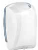
G935 White Dispenser for Center Pull towels