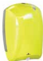
G935 Fluo Dispenser for Center Pull towels