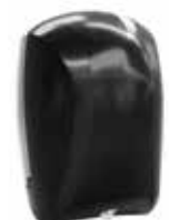
G935 Carbon Dispenser for Center Pull towels