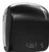
G884 Carbon Dispenser for AutoCut towels