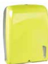
G903 Fluo Dispenser for V towels