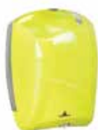
G932 Fluo Dispenser for Center Pull toilet paper