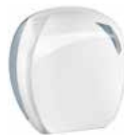
G908 White Dispenser for Maxi Jumbo toilet paper