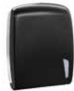
G903 Carbon Dispenser for V towels