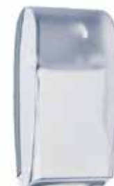
G899 Turquoise Napkin Dispenser

Made in Italy from high-quality materials.