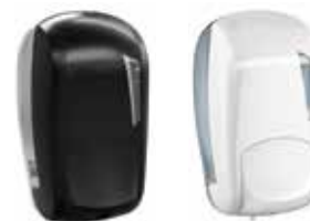
G911 Carbon G911 White Dispenser for liquid soap