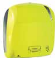
G884 Fluo Dispenser for AutoCut towels