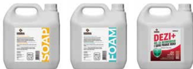
Liquid soap 5L

Disinfectants should be chosen carefully, taking into account their active ingredients and characteristics, and should be used only when we want to achieve deep antimicrobial activity on the hands, or when we do not have water nearby.