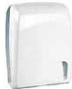
G903 White Dispenser for V towels