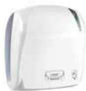
G884 White Dispenser for AutoCut towels