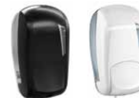
G916 Carbon G916 White Dispenser for liquid soap in a foam

All our dispensers also include an assembly kit.