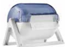
G636 Transparent Dispenser for professional kitchens

Wall stand for industrial rolls, made of lacquered metal, made entirely in Italy from high-quality materials that guarantee strength and durability.