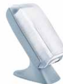
G900 Turquoise Napkin Dispenser

Made in Italy from high-quality materials.