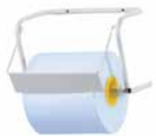
G522 White Dispenser for industrial towels

Floor stand for industrial rolls, made of lacquered metal, made entirely in Italy from high-quality materials that guarantee strength and durability.