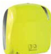
G885 Fluo Dispenser for AutoCut towels Sensor type