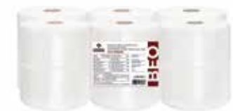
GCP 130M/12 Toilet paper Center Pull 130m