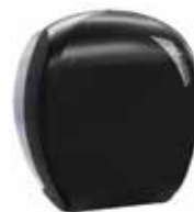
G908 Carbon Dispenser for Maxi Jumbo toilet paper