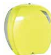
G908 Fluo Dispenser for Maxi Jumbo toilet paper